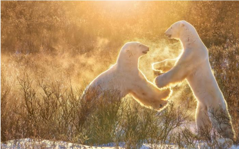
Get close (but not too close) to polar bears in Canada, just one of 50 hand-picked wild encounters

From sea eagles in Scotland to cheetahs in the Serengeti, our expert has the perfect animal encounter for you